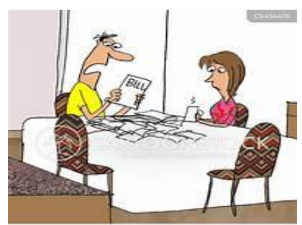
"When it comes to retirement, it looks like 90 is the new 70."